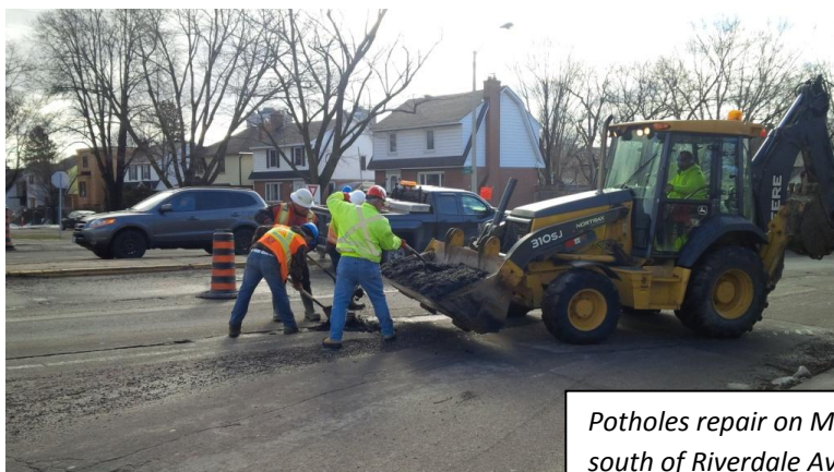
Potholes repair on Main Street south of Riverdale Avenue.

The Sporting Life 10K Run for CHEO event will take place on Sunday May 8 th . For this event, Colonel By Drive will be closed to traffic from Hog's Back Road to Clegg Street from 5 a.m. to noon.