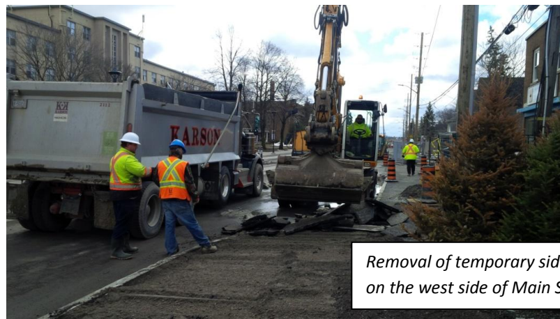
Removal of temporary sidewalk on the west side of Main Street.