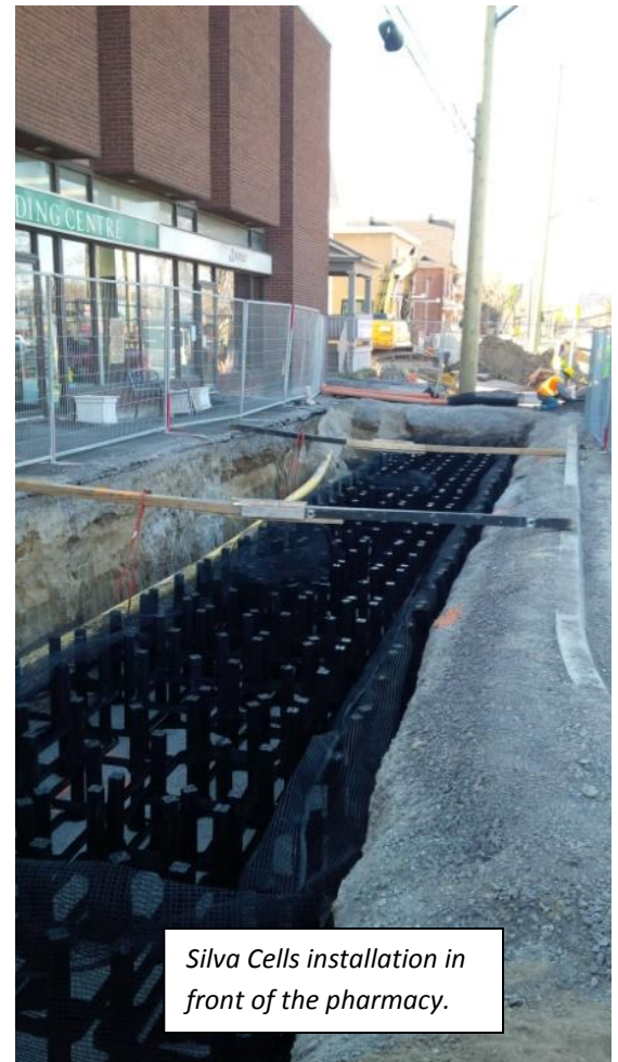
Silva Cells installation in front of the pharmacy.