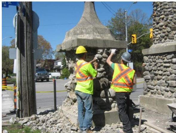
Removal of stone facing of the Brantwood Place Gates

The Tamarack Ottawa Race Weekend will take place on Saturday May 28 th and Sunday May 29 th . For this event, the Pretoria Bridge will be closed to traffic on Saturday May 28 th from 3:30 p.m. to 8:45 p.m. and on Sunday May 29 th from 6:30 a.m. to 2 p.m. For this event, Colonel By Drive will be closed to traffic (Hogs Back Road to Hawthorne Avenue) on Saturday May 28 th from 3:30 p.m. to 8:45 p.m. and will be closed to traffic (Hawthorne Avenue to Rideau Street) on Sunday May 29 th from 6:30 a.m. to 2 p.m.