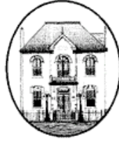
Old Town Hall