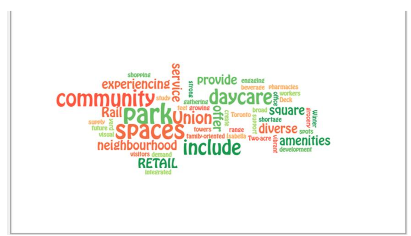
Note emphasis on: community, park, spaces, include, provide, amenities, daycare