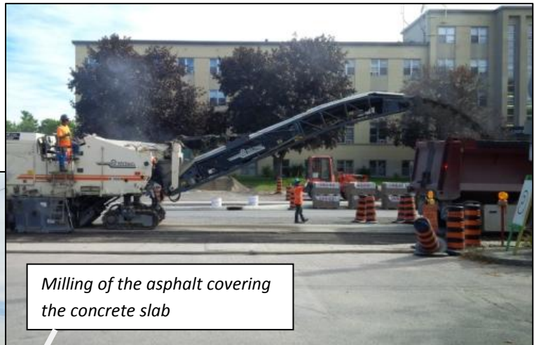
Milling of the asphalt covering the concrete slab