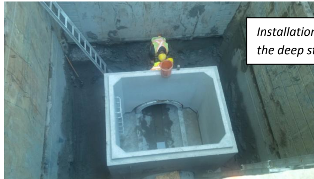
Installation of manhole over the deep storm sewer.