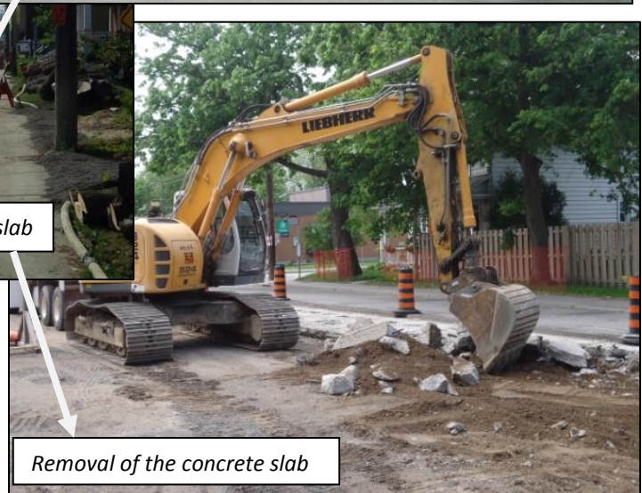
Removal of the concrete slab

Accessible formats and communication supports are available, upon request, at the following link: www.ottawa.ca/accessibleformat