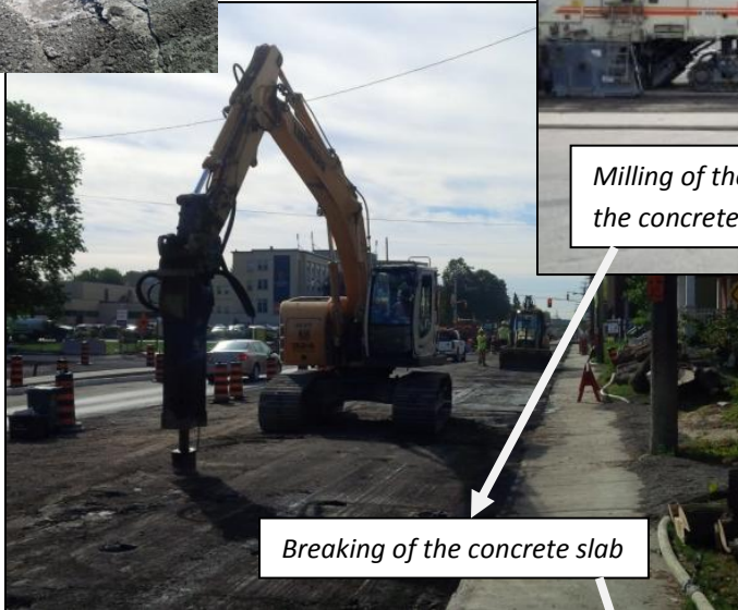
Breaking of the concrete slab