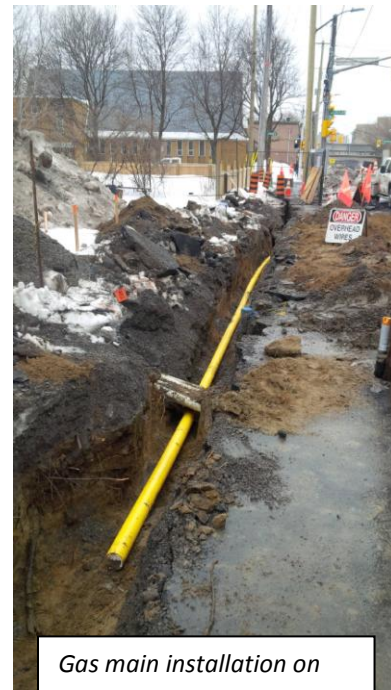
Gas main installation on west side of Main Street.