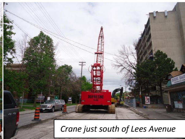
Crane just south of Lees Avenue