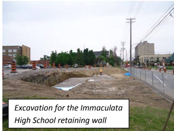
Excavation for the Immaculata High School retaining wall