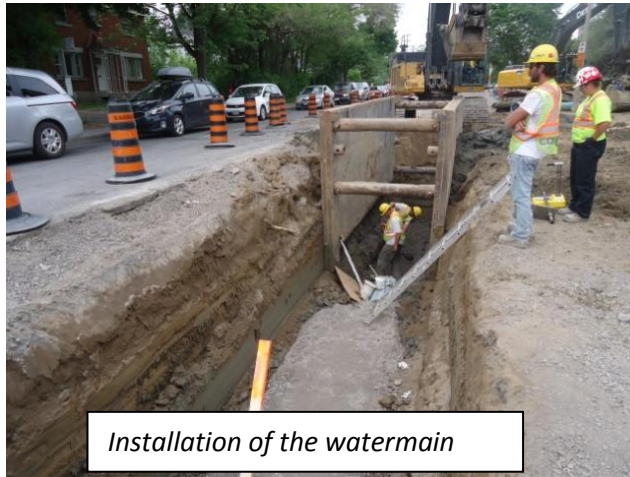
Installation of the watermain