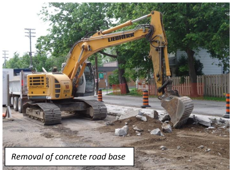
Removal of concrete road base