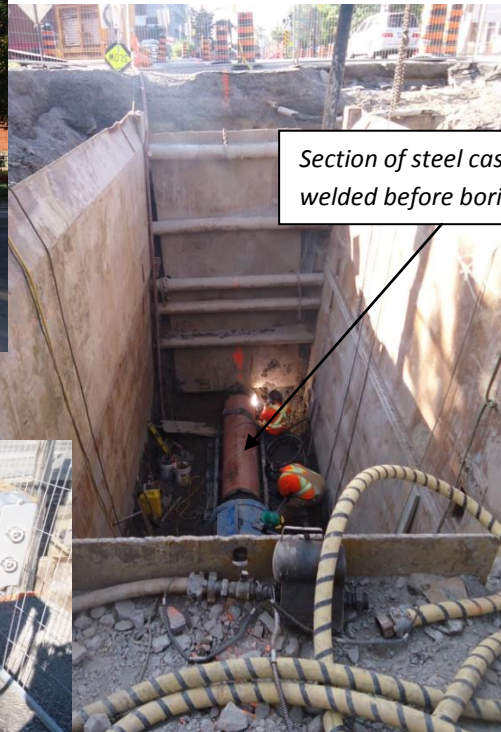
Section of steel casing being welded before boring.