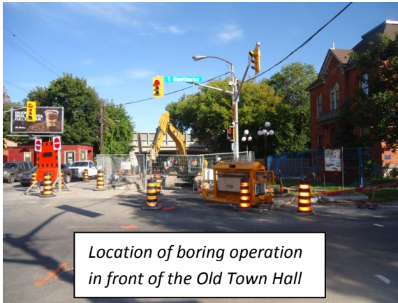
Location of boring operation in front of the Old Town Hall

A large watermain, 1.22 metres in diameter, crosses Main Street at Hawthorne Avenue. This watermain is the primary feed to the east end of the City and transports 1500 litres of water per second. The flow through from this watermain could fill 52 Olympic sized swimming pools every day. A small sanitary sewer (375 mm in diameter) crossing underneath this large watermain needed to be replaced. To ensure the large watermain did not get damaged, the sanitary sewer was replaced by a jack and boring method. During this work, the large watermain was continuously monitored for settlement and vibrations to ensure it remained in good condition.