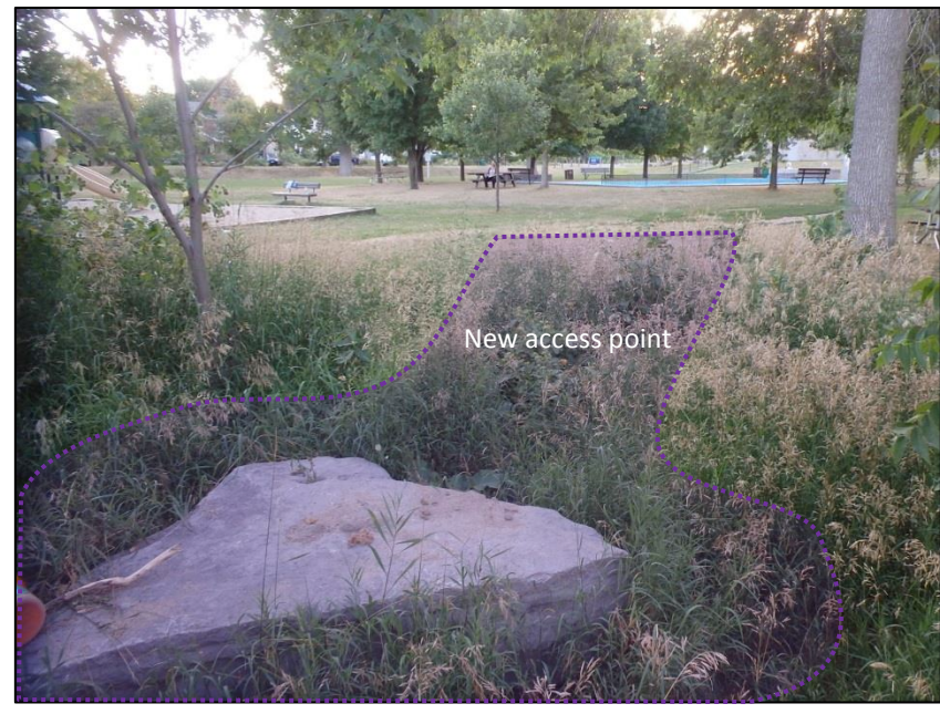
FIGURE 5: PHOTO OF AREA 2 WITH PROPOSED ACCESS POINT TO ENCOMPASS ACCESS TO SITTING ROCK