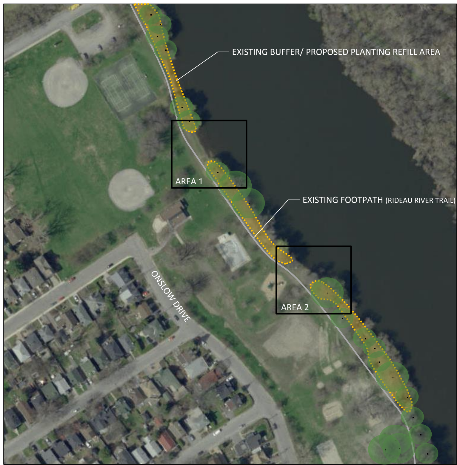
FIGURE 1: OVERVIEW OF RESTORATION/ENHANCMENT OPPORTUNITIES AT BRANTWOOD PARK, OTTAWA.

Enhancement of the shoreline buffer at Brantwood Park in Ottawa, Ontario has been an ongoing effort by local Community Groups (S.L.O.E., Ottawa East Community Association) and the City of Ottawa. In 2016, a site visit was conducted with community members, a member of the local Councillor's Office and the Rideau Valley Conversation Authority to discuss the issue of geese droppings in the park and potential enhancements for the existing shoreline buffer. The following is an overview of suggestions for potential shoreline restoration activities based on this discussion.