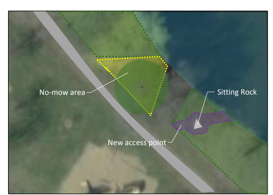
FIGURE 6: OVRHEAD VIEW OF PROPOSED CHANGES TO AREA 2