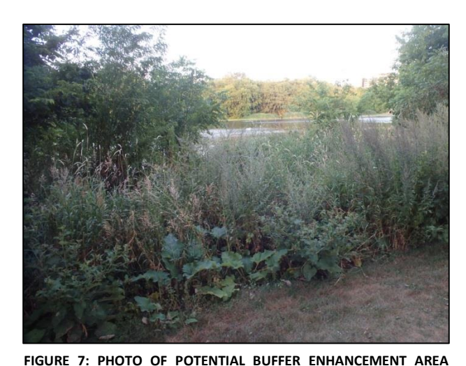
THAT HAS BEEN TAKEN OVER BY BURDOCK.