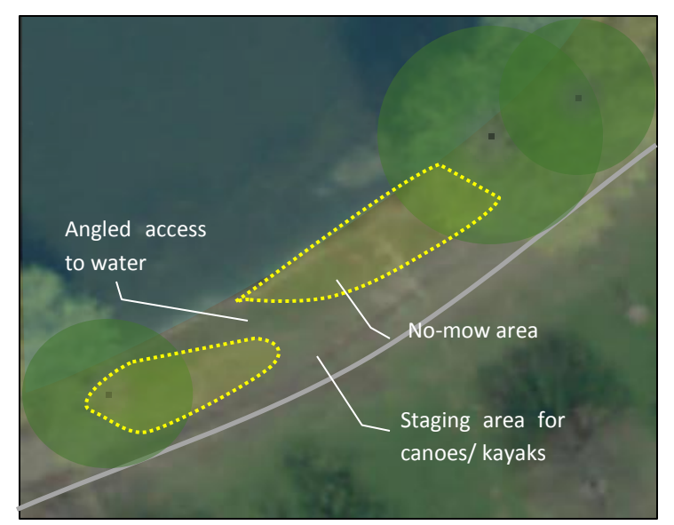
FIGURE 3: OVERHEAD VIEW OF PROPOSED NO-MOW/NATURALIZATION AREA